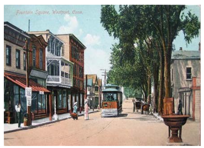
Postcard of Main Street 1913

Although colonists settled along the Saugatuck River in 1639, Westport was officially incorporated as a town in 1835 with land taken from Fairfield, Weston and Norwalk. For several decades after that, Westport was a prosperous agricultural community, which distinguished itself as the nation's leading onion-growing center. Westport's Compo Beach was the site of a British expeditionary force's landing, in which about 2,000 British soldiers marched to Danbury and razed it, resulting in the Battle of Ridgefield. They were attacked on the way and attacked upon landing by Minutemen from Westport and the surrounding areas. A statue of a Minuteman, rifle in hand, is located near Compo Beach.