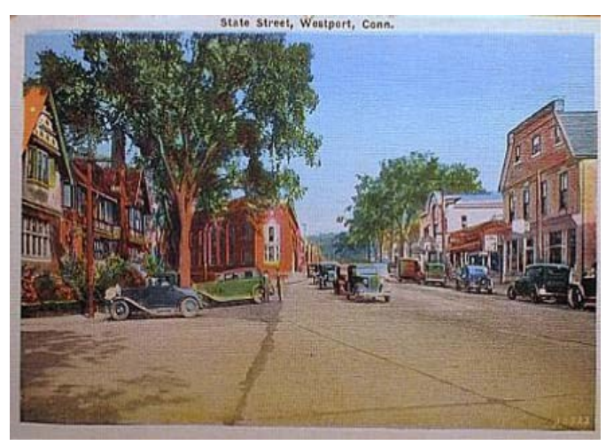
Postcard of Post Road 1937