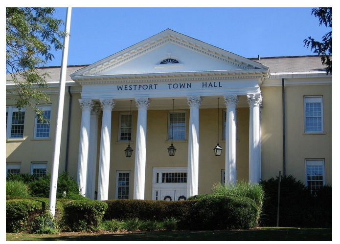
Westport Town Hall