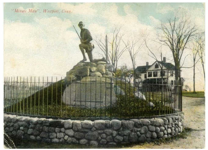
Minute Man at Compo Beach 1912