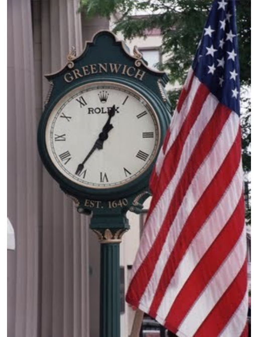
Greenwich Avenue Clock